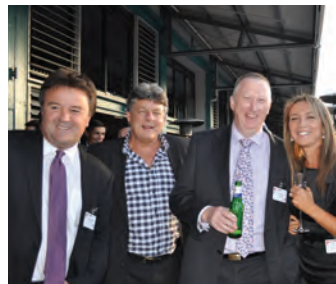
Assetlink Sydney Client Christmas Party

Thank you to all of our fabulous clients and hardworking, loyal and dedicated staff for making this a great year.